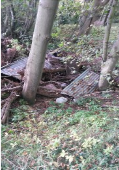
old shaft mound

Further up the hill, towards the boundary fence with farmland near SH92707746, there are a series of shallow depressions which could be ancient surface trials or the site of collapsed shafts. The latter seems more likely as the spoil heaps are not very extensive. There seems to be little else in the area until old shaft mounds are encountered on the edge of the woods at SH92227733 and this really marks the limit of exploration from this side.