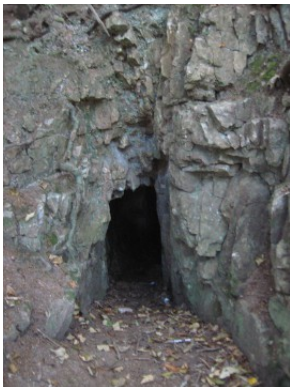
Gwrych Castle Adit

Access to the Castle, the remains of the adit and the open shafts further up the hill is easiest via the 'green gate' on the Tan-y-Gopa road at SH93397717. There is space for a couple of cars to be parked at the entrance to the Tan-y-Gopa woods. Passing through the gate there is a dirt track which heads directly towards the castle. There is a significant amount of landscaping work in progress but it should be possible to climb up the hill to a higher path which passes above and behind the castle. The castle adit lies at SH92757753 in a clearing with a few trees. It is not possible to see the adit from the upper path and it is not very obvious from a lower one. A GPS seems to work fairly reliably and is recommended to aid navigation, there is a dead tree just above the adit but other than that there are no other markers. The adit heads directly into the hillside in a SW direction, but is blocked after about 15m by sandy in-fill. It would be an easy dig, but further collapses may be a problem and it is in an area popular with families.