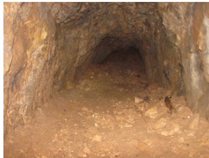
End of Adit

Heading directly up the hill proves more interesting as there is a long trench in a fenced off area. The first thing of note is an open hole at SH92737752 with a convenient nearby tree as an anchor. The hole looks like it is probably the result of stopes reaching the surface and it there looks to be an earth bridge dividing the hole. The hole is about 28m deep and has quite a few blocked side passages and some pack-wall. There are traces of galena on the walls. There is quite a lot of loose material around, but there should be no problems descending/ascending the hole. Use a rope protector or arrange a deviation from one of the other trees. A little further up at SH92727750 is a square shaft. We did not descend this but think that this is the shaft GOES went down in 80's and, again, this seems to have suffered from collapses in the connecting passages.