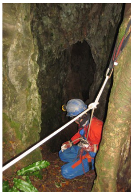
Abseiling the stope

Heading directly up the hill proves more interesting as there is a long trench in a fenced off area. The first thing of note is an open hole at SH92737752 with a convenient nearby tree as an anchor. The hole looks like it is probably the result of stopes reaching the surface and it there looks to be an earth bridge dividing the hole. The hole is about 28m deep and has quite a few blocked side passages and some pack-wall. There are traces of galena on the walls. There is quite a lot of loose material around, but there should be no problems descending/ascending the hole. Use a rope protector or arrange a deviation from one of the other trees. A little further up at SH92727750 is a square shaft. We did not descend this but think that this is the shaft GOES went down in 80's and, again, this seems to have suffered from collapses in the connecting passages.