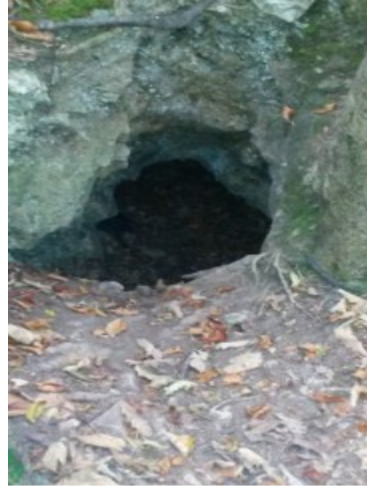
Adit near Dulas Cave