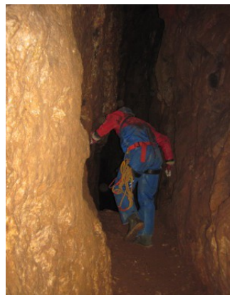
At base of stope